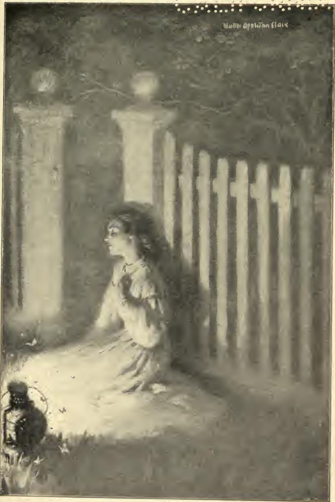
“HE FOUND HER HUDDLED AGAINST THE GATE-POST, WAITING FOR HIM”